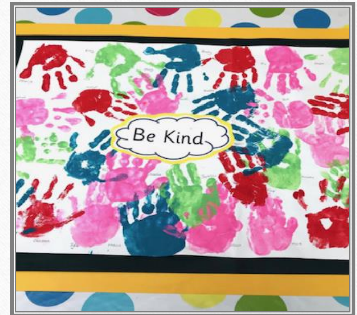
Anti-Bullying week poster