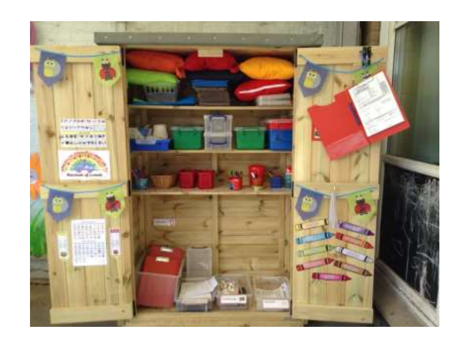
This is the outside maths area.